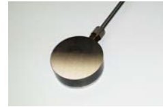
Load cell (insensitive to temperature)