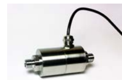
Differential pressure sensor