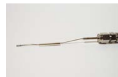
Spot weldable strain sensor