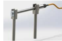
Extensometer (insensitive to temperature)