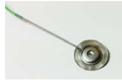
Low profile pressure sensor