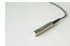
Absolute pressure sensor